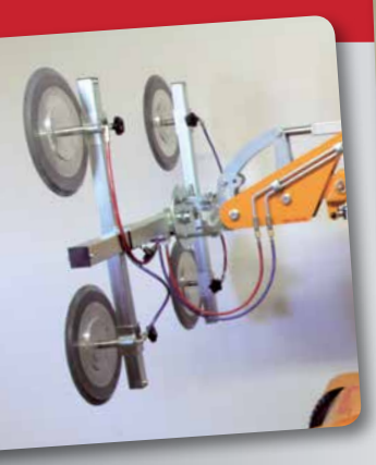
The vacuum system is separated into two vacuum circuits for highest security. Showing vacuum circuits with blue and red vacuum hoses