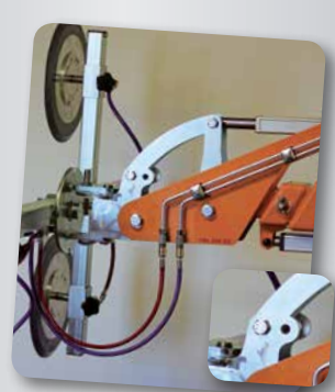
The lifting head has two settings, adjusted by means of two holes for the locking bolt. The lifting head can therefore be adjusted to tilt more towards the ceiling or floor.