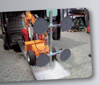
The Smartlift is easily transported in a van or on a trailer