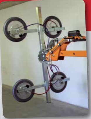
The yoke has movements in all directions